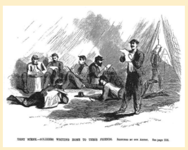
Soldiers writing home to their friends. Outside winter camps and barracks, common soldiers usually lived without any furniture.