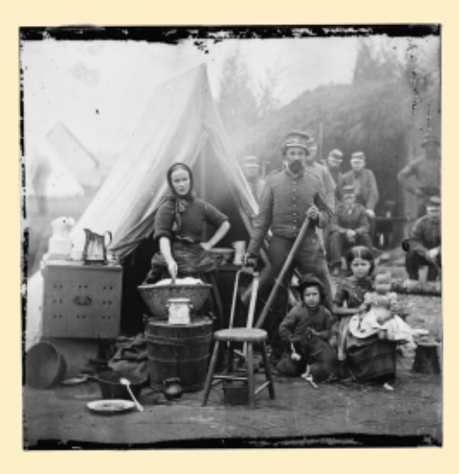
This soldier and his family enjoy a relative luxury of fixed camp. Our reenactment aims at short-lived camp life in the middle of military campaign.