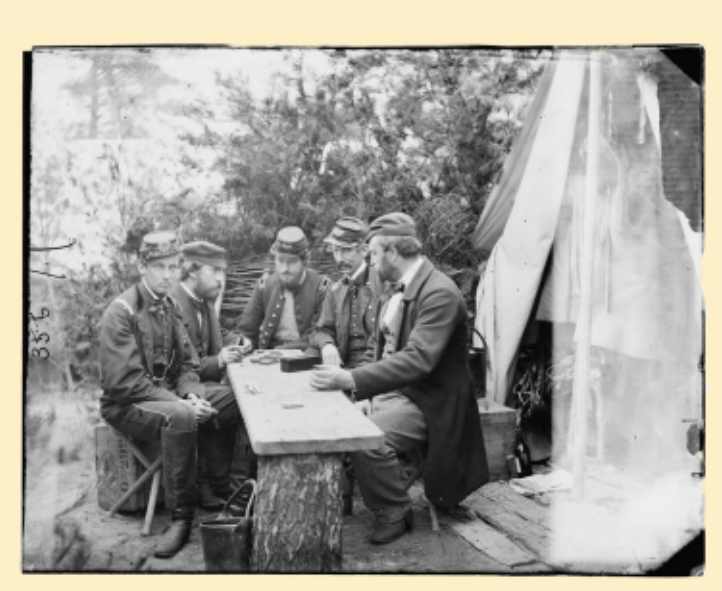
Union officers playing dominoes at improvised mess table